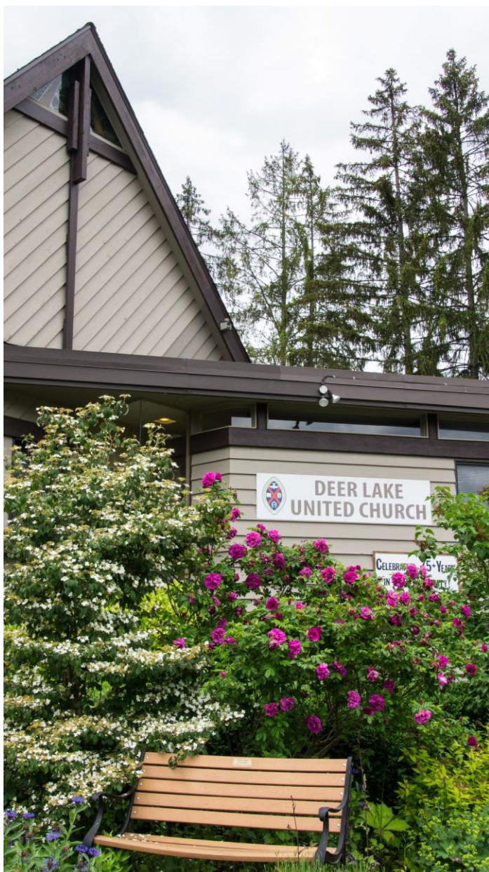
Angels have made our garden a blossoming beauty