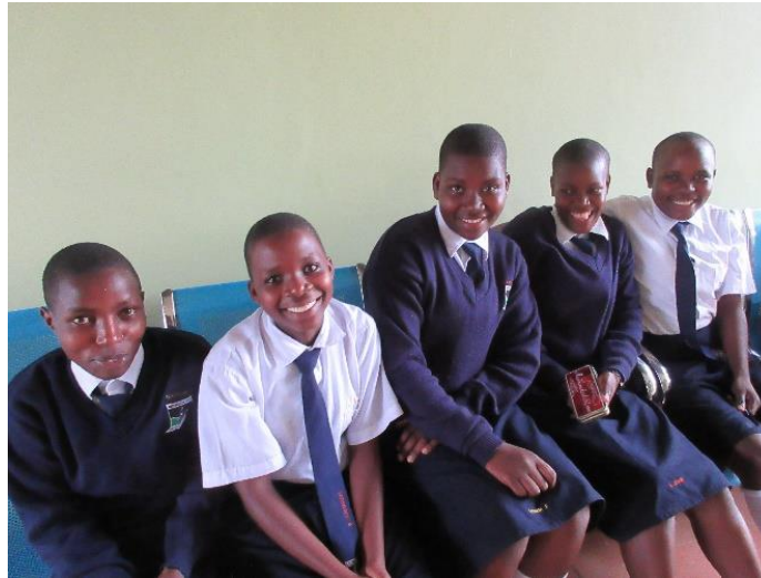
A group of girls from Mpoma Secondary School