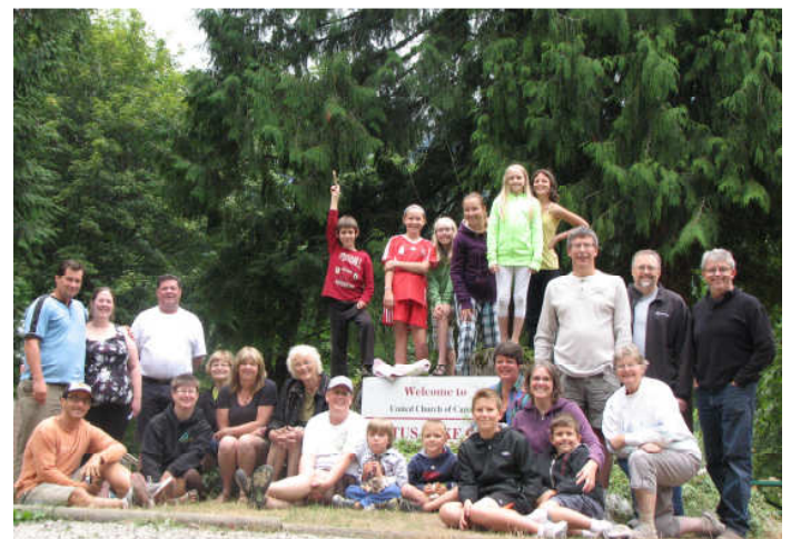
Kids of all ages gather to enjoy the nature of Cultus Lake