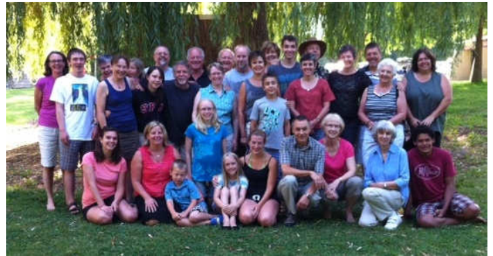
Deer Lake Church well represented at Music Week