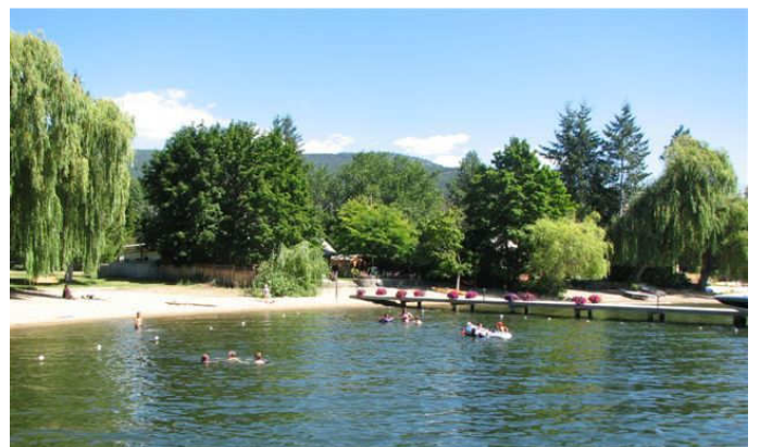
A couple of summer scenes of Lake Okanagan (Naramata)