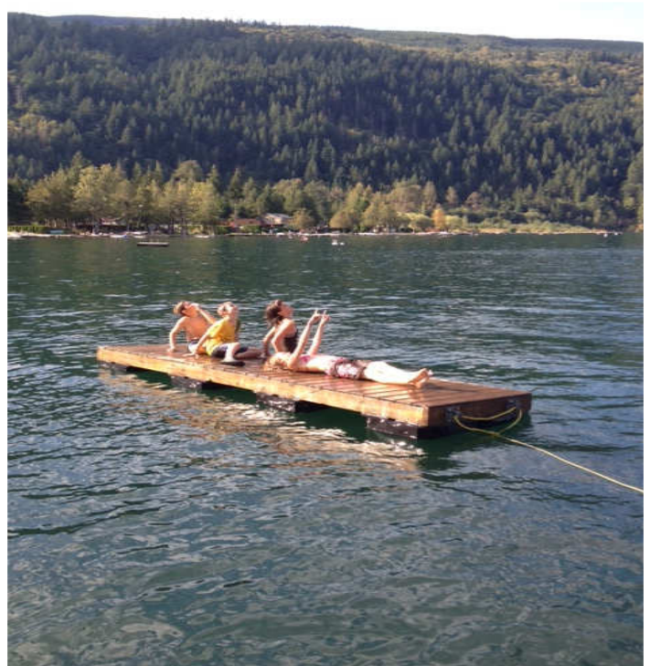
Creating memories on the float at Cultus Lake

It was truly a blessed weekend and we all encourage more people to come next year. It is a wonderful time to renew old friendships, to share summer memories and to get to know others much better.