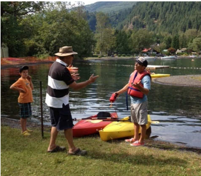
A picture is worth 1000 words.