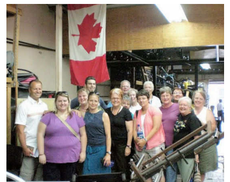
At the wheelchair project

At the end of the 10 day trip we were positive that we were there much, much longer. It was an amazing experience and I suggest a G.A.T.E. trip to anyone wanting to travel to Latin America. It is an experience that is hard to sum up in a quick article & is one that will stay with me forever.