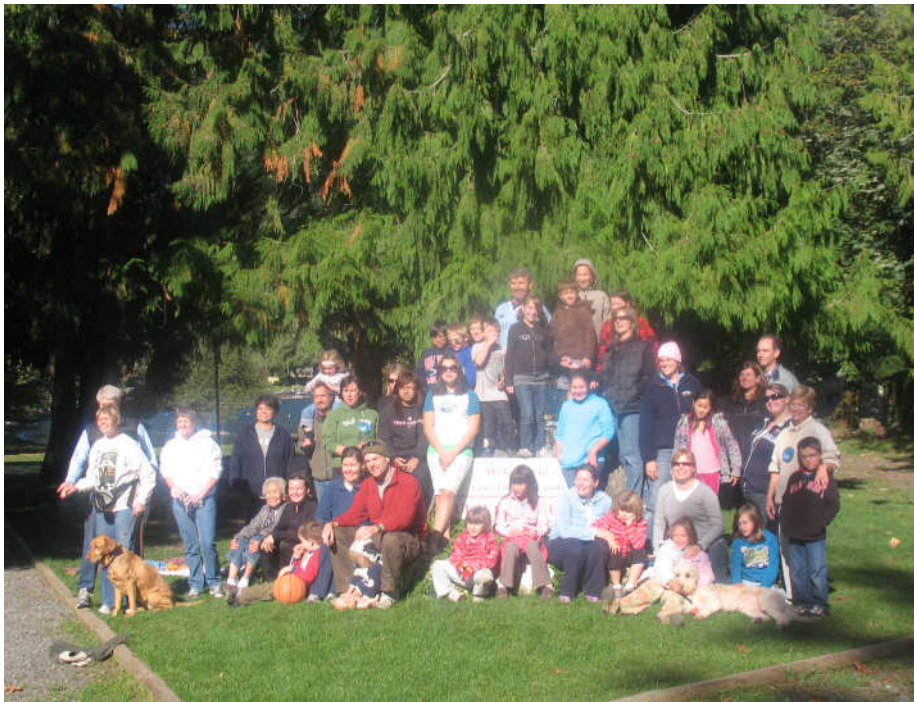
These Cultus Lake campers are so happy, they're literally glowing!

Those of us who were there certainly want to have it happen again next year. Perhaps there will be more readers and a contributed load of books to read in the sun.