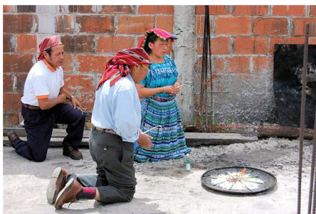
Traditional Mayan ceremony