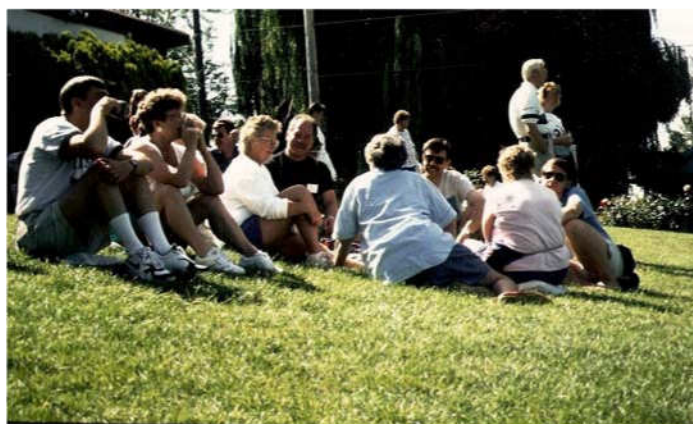
A few Naramata photos from years gone by