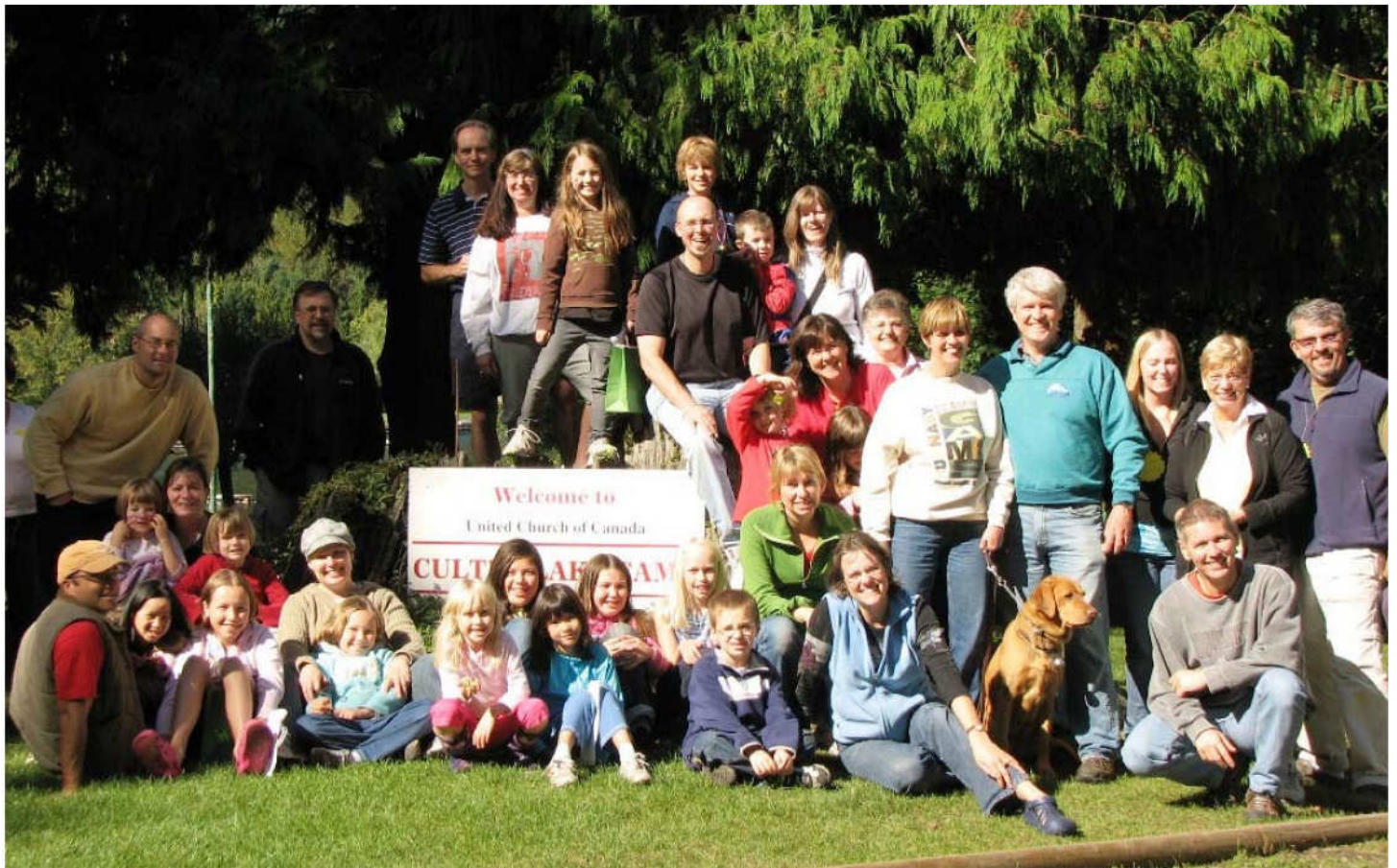
The gift of warmth and sunshine went a long way to put smiles on the faces of these very happy Deer Lake campers.