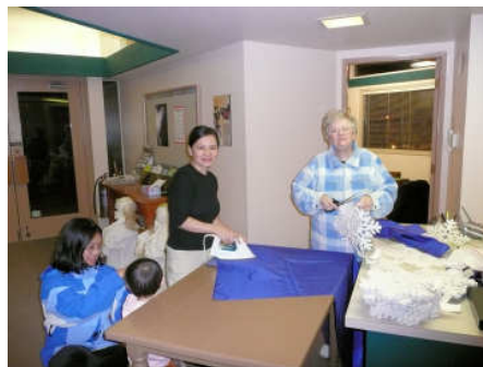
Congregations working together to bring Christmas cheer into the sanctuary and narthex.

Be sure to get a close look at the tree to see the decorations the children made. They are all a-glitter!