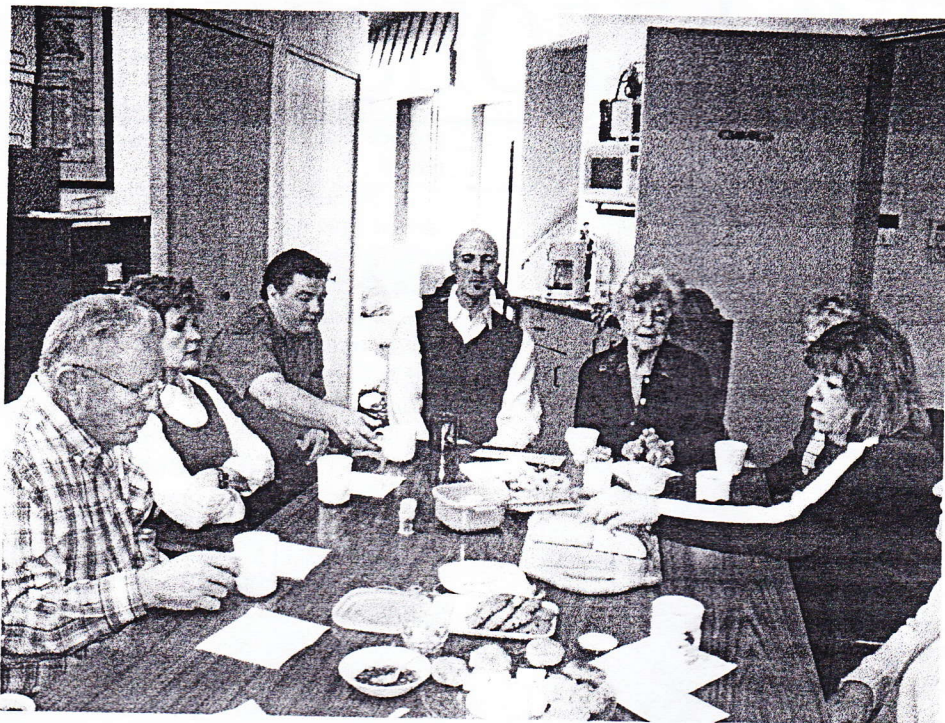
Apparently the bread didn't taste so good