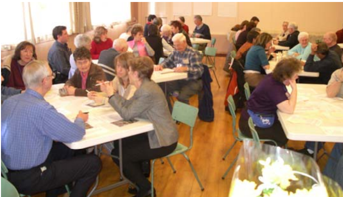
A number of the assembled at the annual general meeting