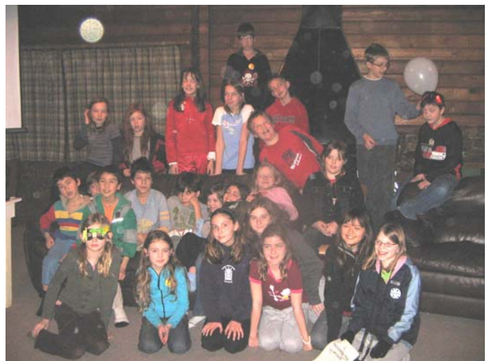
The participants from the "Incredible You" Conference

I recognize that my presence as a leader at this camp was a tremendous gift from Deer Lake to the ministry of the larger church as it took me away from regular Sunday leadership responsibilities. I thank you for freeing me up to engage in ministry with some of the fine children of our presbytery.