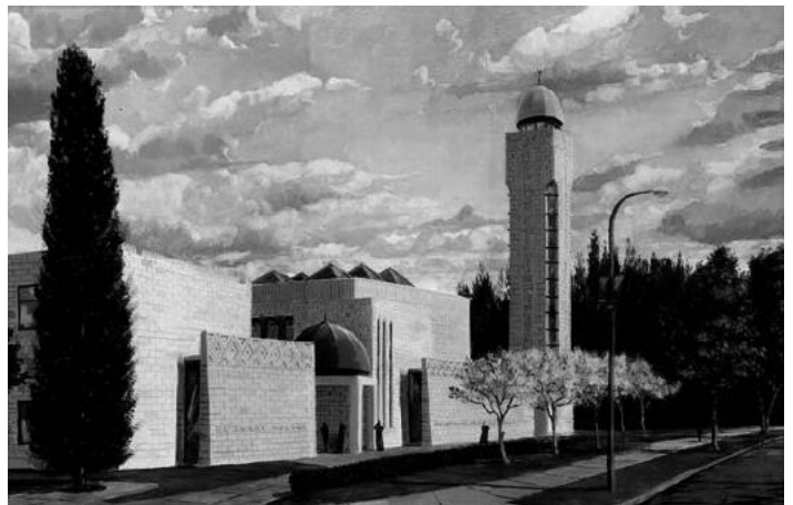
Artist's conception of completed mosque

More information on the open house, the Burnaby Mosque, the BC Muslim Association and Islam in general can be found on their website at http://www.bcmaburnaby.org .