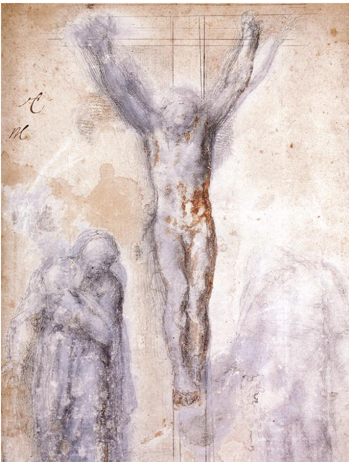
Crucifixion by Michelangelo

A sign up sheet for this event will be posted in the Fellowship Hall in early April. Space is limited so sign up early to not be disappointed.