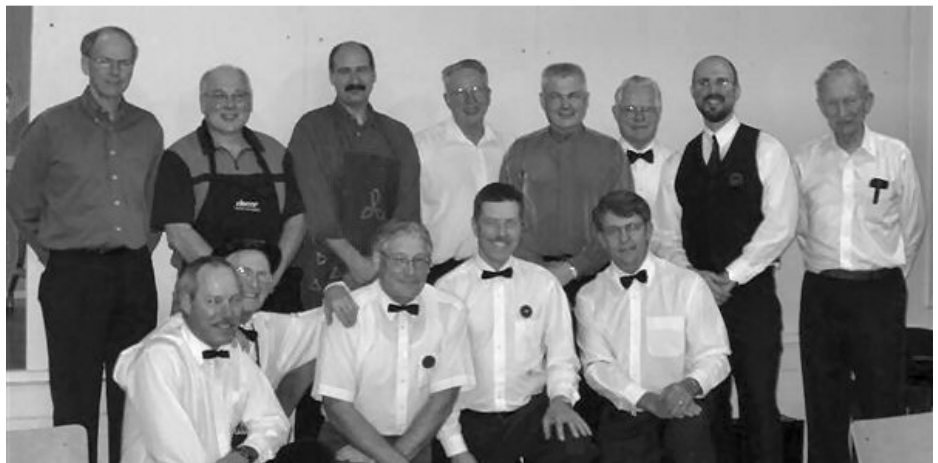
The men who made it happen