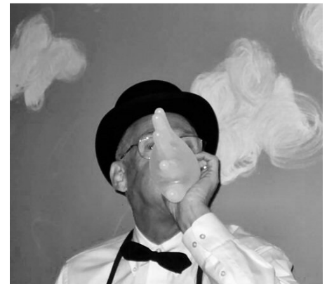
Does anyone know this man?